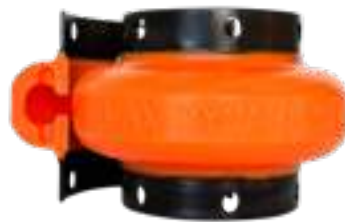
MAX DYNAMIC Element

Polyurethane Element See MAX DYNAMIC Couplings