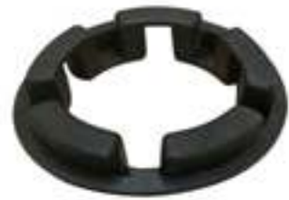
NM Coupling Elements