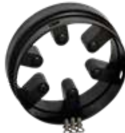
Jaw Elements (Snap Wrap Kit)

Nitrile Rubber & Retaining Ring- See Jaw Couplings