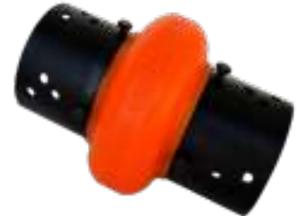
MAX DYNAMIC Spacer Element

Polyurethane Spacer Element See MAX DYNAMIC Couplings