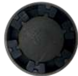
Flexible Pin Element

Nitrile Rubber & Retaining Ring- See Jaw Couplings