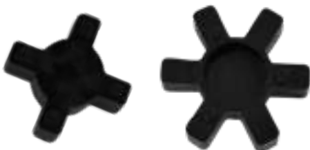
Jaw Element (Spider)

Nitrile Rubber - Small to suit size 050-070 Large to suit size 075-225 - See Jaw Couplings