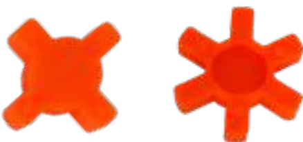
Jaw Element (Poly-Spider)

Polyurethane - Small to suit size 050-070 Large to to suit size 075-276- See Jaw Couplings