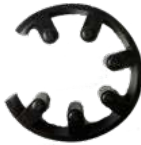
Jaw Element (Snap Wrap)