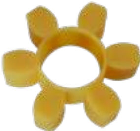
HRC Element (PUE)